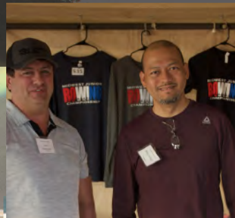
CJRC Parent Volunteers