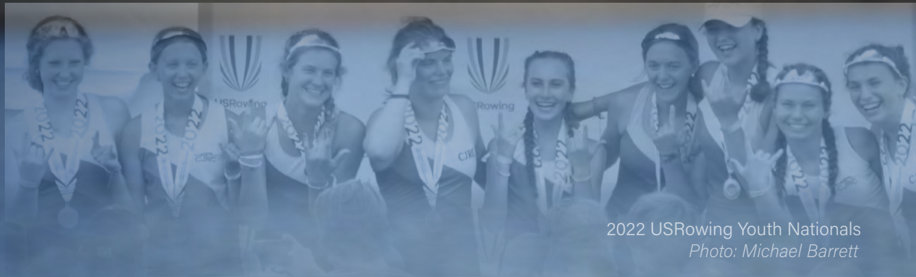
2022 USRowing Youth Nationals

We are proud to be a program driven by the rowers and open to anyone — regardless of experience or income level.